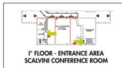
1° FLOOR - ENTRANCE AREA SCALVINI CONFERENCE ROOM